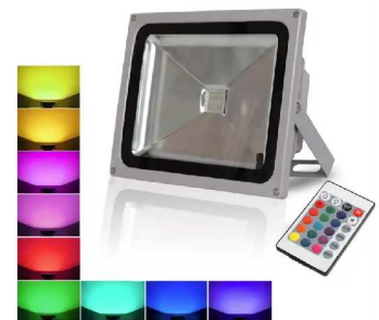
RGB FLOOD LIGHT Input: 90V - 265V AC 50Hz

Illuminate any area with color changing RGB flood lights. Easy to operate using remote control