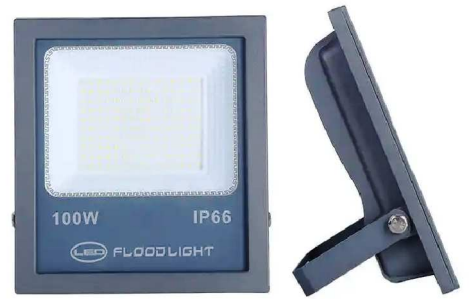
Slim LED Flood Light Input: 100V - 300V AC 50Hz

Flood light with slim body. Provides low cost lighting option for open areas including play grounds, construction sites