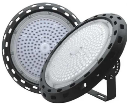
UFO Light Input: 100V - 300V AC 50Hz

High bay UFO lights with lens. Provides uniform lighting in wide area. Aluminum die cast body for long product life