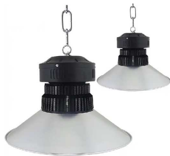
HIGH BAY LIGHTS Input: 100V - 300V AC 50Hz

High Bay lights provide uniform lighting and are easy to install. High power LED with CRI 80 and natural cooling