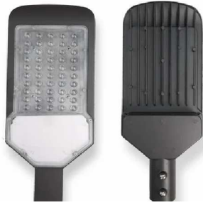
AC Street light D2D Input: 100V - 300V AC 50Hz

AC Street Lights with lens. Wide input voltage. Long product life. Auto dusk to dawn function. With 2 year warranty