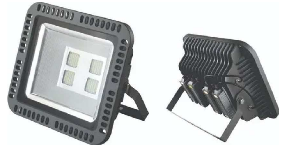
AC Flood Light Input: 100V - 300V AC 50Hz

AC Flood lights with high quality reflector. Multiple power supplies for reliable performance. 2 year warranty